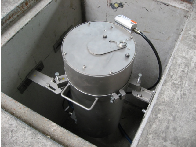
III. 3: Stainless steel housing with pneumatically power hatch to protect the measuring instruments, converter components and sensors

thermographically. The degree of emission of the product's surface can be determined beforehand to ensure accurate measurements.