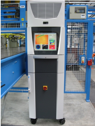
III. 1: Control- and evaluation unit, used to operate the press camera and to transmit evaluations to the press control

and evaluates digital images delivered by the thermography camera. The results will be sent to the guide-system of the production process in accordance with the presses clock cycle. It is possible to manage different moulds and evaluate and record their respective data at once. This guarantees universal system operation for various orders which are being processed by the machine.